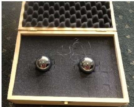
Name of the ship on the packing case